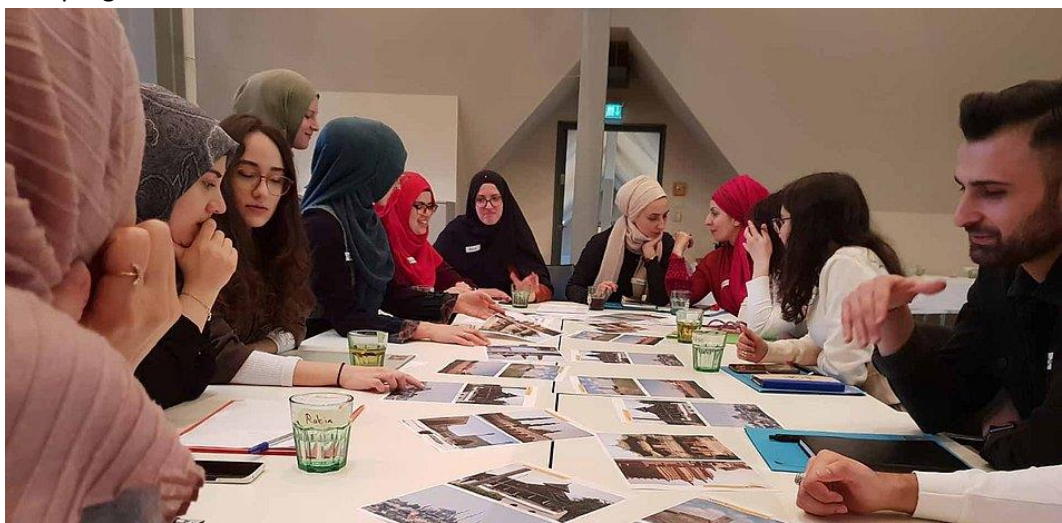
Figure 15: TAMAM workshop

The most important value of these activities is that participants have the opportunity to express their own perspectives and opinions, to exchange and discuss these (Fig. 15) and also to share them with a more extended public (if they want) including their relatives and their further social surroundings. Such interaction enables them to connect their ideas within new circumstances with other perspectives and to develop these even further. Such positive effects can be recognised in the ISL-projects as well as in the school programmes.