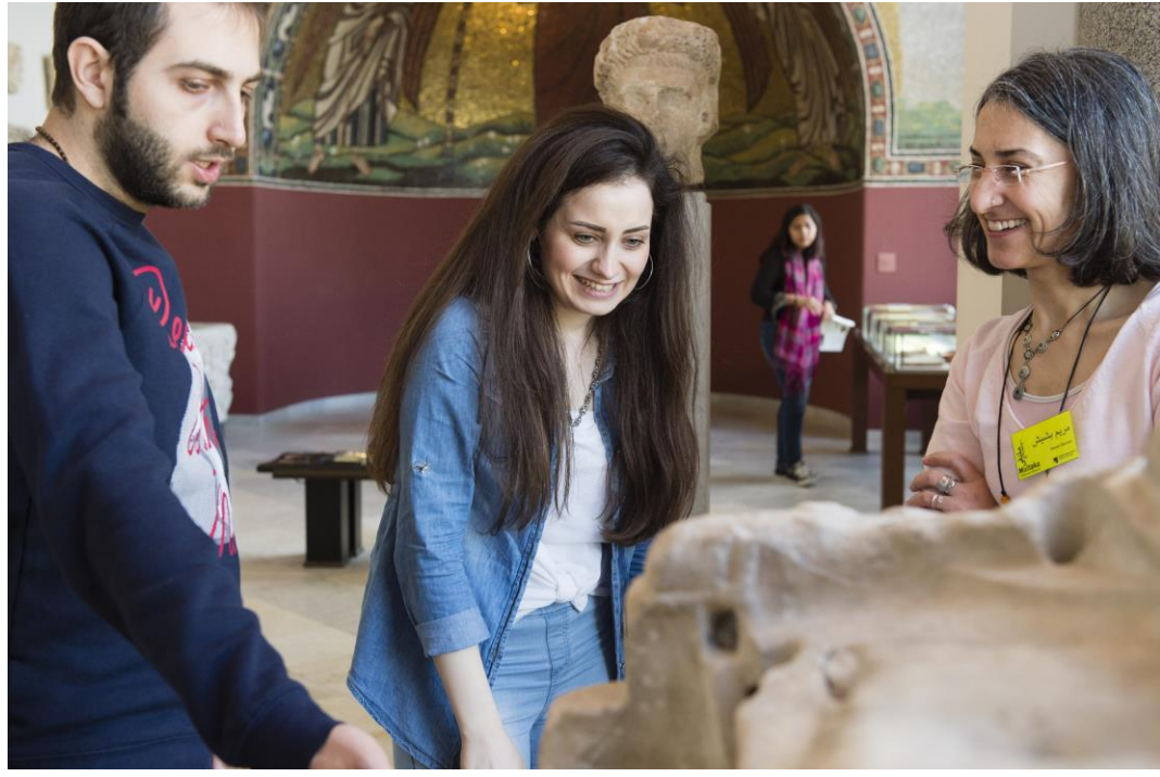
Figure 12: Participants of a guided tour of the project "Multaka" in the Museum für Byzantinischen Kunst and Skulpturensammlung (Bodemuseum, SMB-PK)