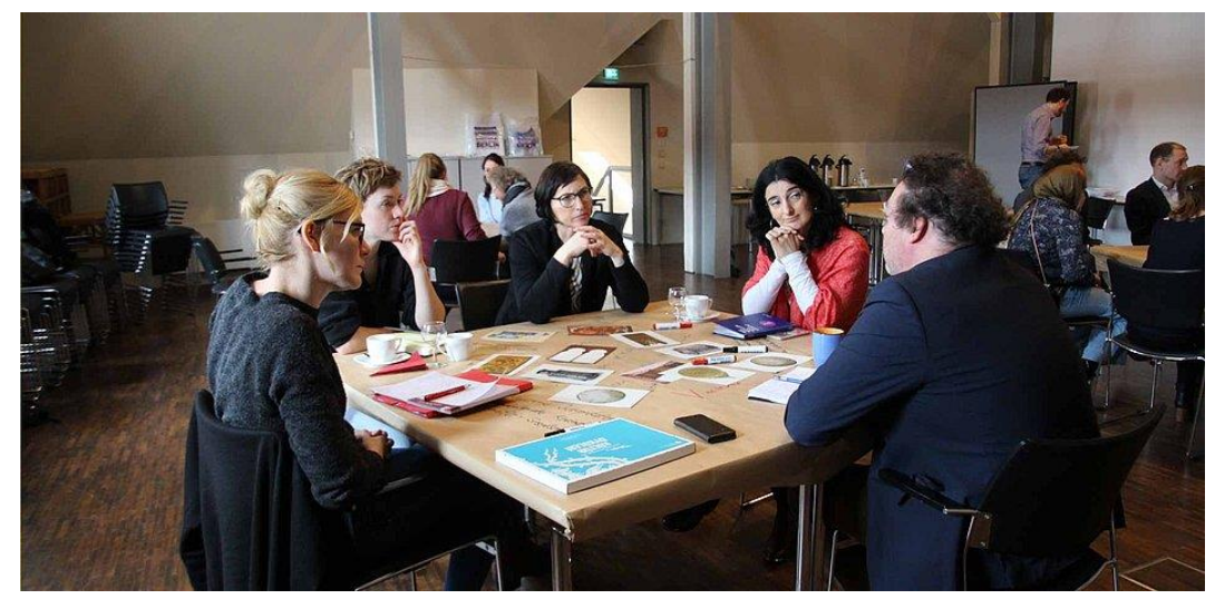
Figure 21: Discussions with representatives of educational media during the expert exchange "Islam, culture and history in educational media"