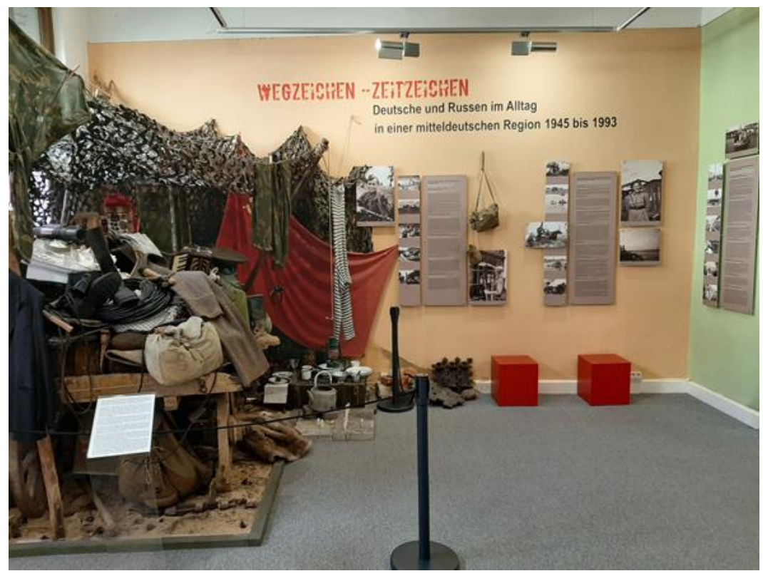
Figure 20: Exhibition "Way and time marks - Germans and Russians in everyday life in a Central German region 1945 – 1993"

© Christel Panzig, photo: Christel Panzig