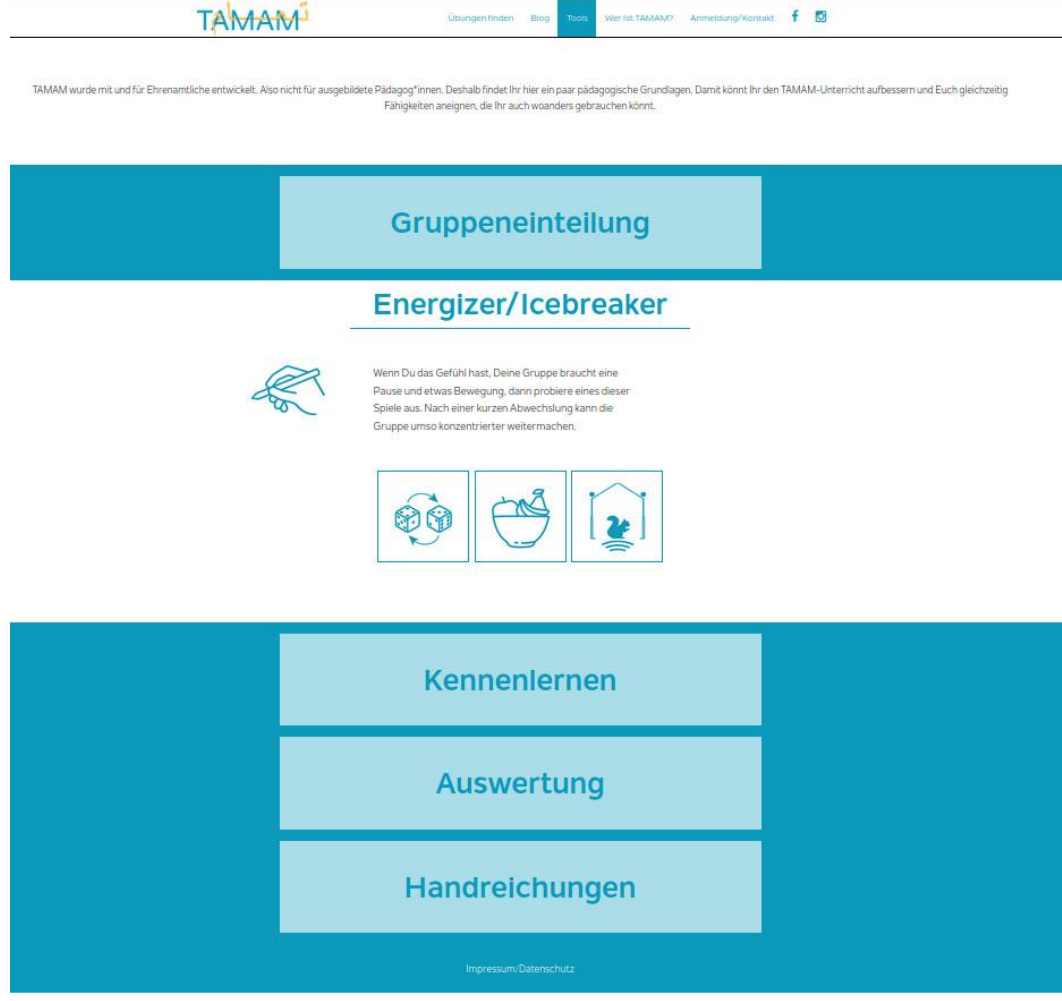
Figure 13: TAMAM, tools<sup>76</sup>

This project uses diverse media to transmit its procedures and outcomes. On its own website it provides the jointly developed learning materials as free to use by anyone interested in intercultural education (Fig. 13). As the project was specifically aimed at volunteers involved in the social and cultural work of mosque communities, it also supplies a pedagogical toolkit on the website. This is specifically in order to support the communities not only with educational content but also with appropriate pedagogical methods. Furthermore, it runs a blog on this page to provide further information and project news updates. In addition, the project communicates with a wider public via Facebook and Instagram: both of these platforms offer further opportunities for exchanges to take place. At the end of the first phase, the project also developed the TAMAM app to be used within the museum exhibition. This app provides the visitor with an augmented reality experience with 16 selected objects / artefacts that are also used and discussed in the learning materials developed for the project. In addition, the app provides further information about these cultural assets. Access to this data is not restricted to the museum premises alone, as the app can also be used at home, in the mosque facilities or elsewhere.<sup>75</sup>