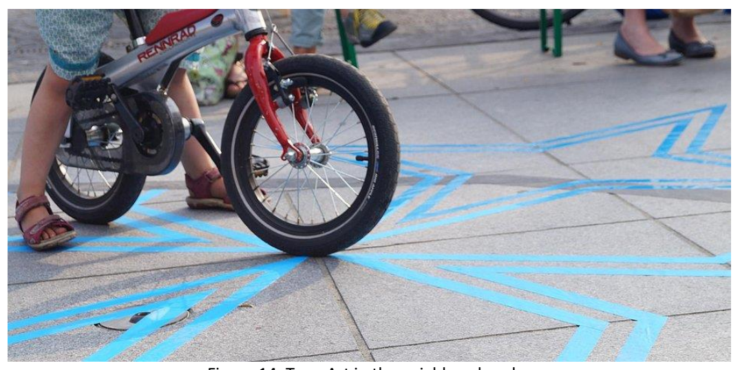
Figure 14: Tape Art in the neighbourhood

The workshops with young people that followed were realised in collaboration with both museum and theatre educators. There, the participants were encouraged to reflect upon and talk about the history and significance of intercultural exchange and identity development through the means of different strands (such as photography, videography or drama) and using the museum collections as an inspiration. This gave the young people the opportunity to take ownership of interpretation of the collections through a personal approach. Working with and around cultural assets enabled them to develop diverse, new and individual narratives and attitudes. The workshops were originally intended to take place both in the youth clubs and in the museum itself, but in order to reduce the inhibition threshold, project staff more often went out into the neighbourhoods (Fig. 14). In addition, the project team offered special tours through the exhibition that were realised by an external guide and adapted to the particular purposes and needs of the project (concerning topics and communication). The outcome of the workshops was presented in November 2019 through a temporary exhibition in the MuseumLab. It was also published in a brochure. In doing this, the organisers wanted to make migration - and its implications - more visible to a wider public.