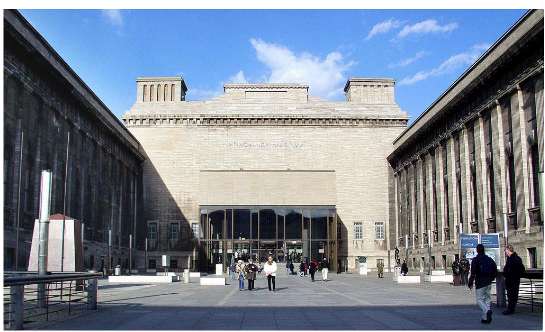
Figure 10: Pergamonmuseum, SMB-PK

The museum also undertakes diverse collaborative research projects. Projects concerning archaeological sites are conducted with partners mainly in Syria; in contrast, research dealing with the collections is mainly realised with German partners (universities, museums, research institutes, inter alia Institut für Museumsforschung). Since this study is above all focused on the interaction between institutions and citizens / non-professionals, the afore-mentioned research projects are not considered in the following reflections. Instead, the focus here is on local outreach projects that go beyond the regular education programme.