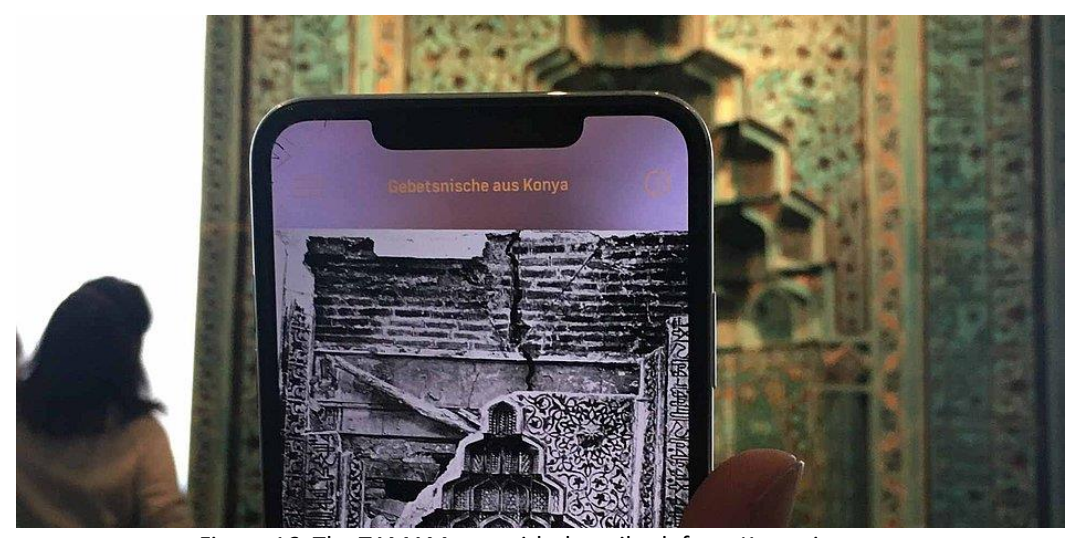
Figure 16: The TAMAM app with the mihrab from Konya in use

The current limitation of the impact of the projects for the broader public, for people not directly involved and for potential participants is partly caused by a less integrated and somewhat unbalanced approach (in comparison with regular content communication). Apart from the project's own publications, dissemination and temporary exhibition, the outcome and results have so far rarely been included in other museum communications. Therefore, general audiences have little opportunity to learn about the content or the experiences exchanged during the course of the projects. In these cases, an app such as the one developed during TAMAM could serve as a bridge between museum knowledge and the projects' own outcomes (Fig. 16). However, in so far as it is possible to discover, (outside the museum premises) this app only provides art historical information: other perspectives and further interpretative layers are not yet included.