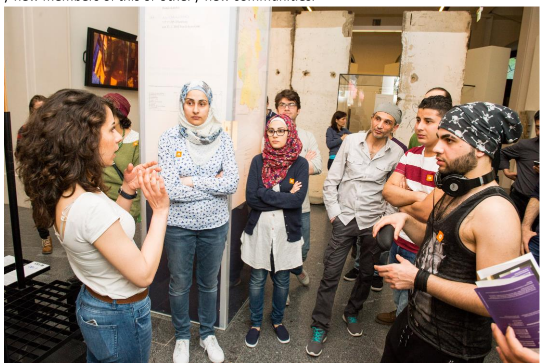
Figure 18: Participants of a guided tour of the project "Multaka" in the Deutsches Historisches Museum © Staatliche Museen Berlin, Museum für Islamische Kunst, photo: Milena Schlösser.

It becomes particularly interesting when the physical component of space no longer exists, whether due to war and destruction, or even structural changes, and thus the community and its interactions must assume new forms. New mechanisms must then be developed in order to carry out heritage work and keep heritage alive and meaningful (in new frameworks) as part of new (forms of) negotiations in new contexts. This includes reorientation and reorganisation, and, sometimes, even reconnection with heritage. This pilot has identified various examples in which the participants shared and sometimes preserved their experiences and expertise within new contexts, providing knowledge and access for other / new members of this or other / new communities.<sup>82</sup>