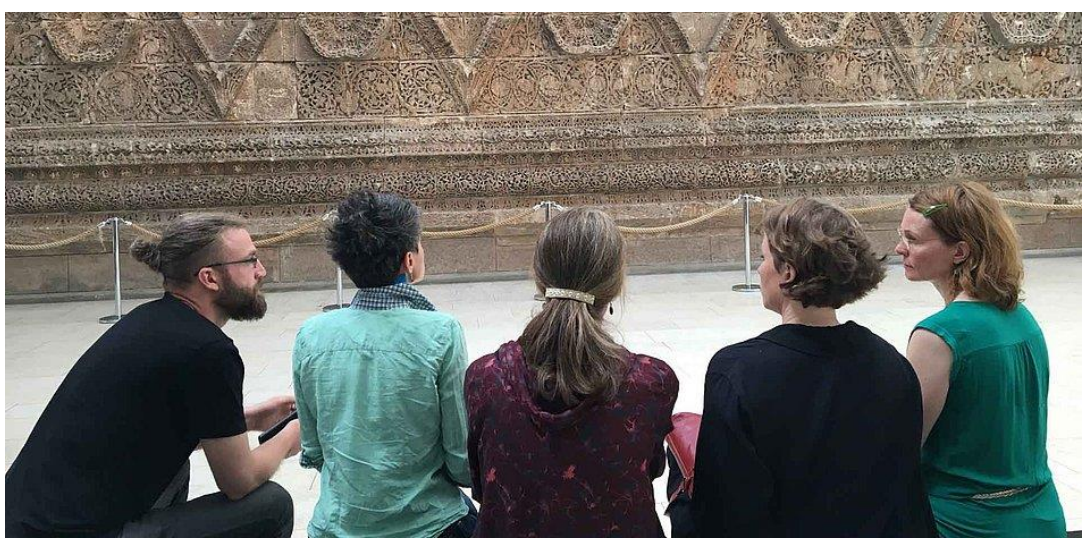
Figure 17: Mschatta façade, reflecting transcultural exchange and societal diversity.

The ISL uses its collections as starting points for all its participatory activities (Fig. 17). Nevertheless, they do not form the basis for participants' self-understanding (either as an individual or as a community). This might be due to the nature of the collections consisting of artefacts of 'high' culture from the 7<sup>th</sup> until 19<sup>th</sup> century stored in the museum exhibitions or depots. They, thus, are not directly related to the people involved. The ISL projects can change this, since they provide new access to this cultural heritage, and the objects gain new significance through the interactions.