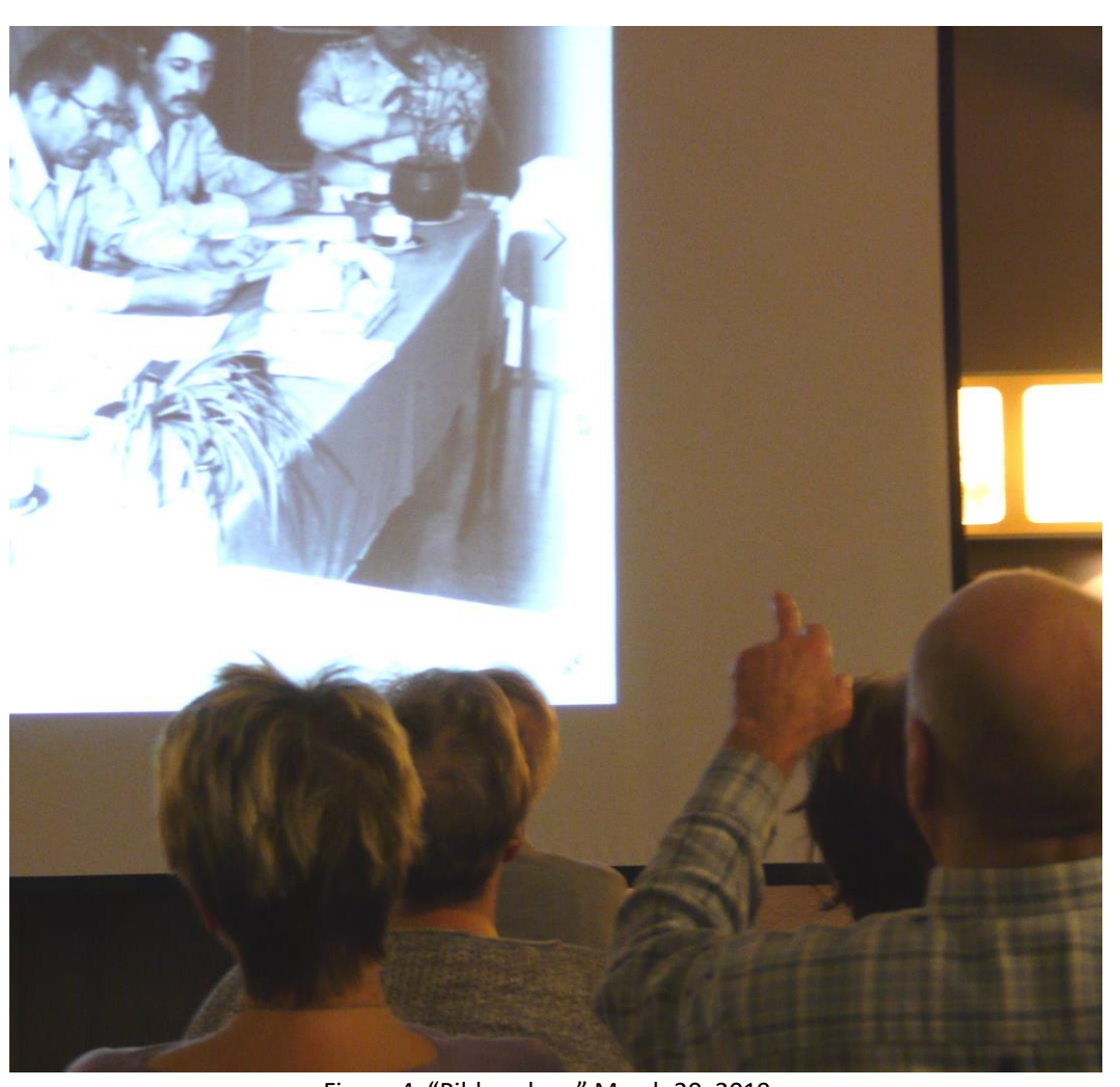
Figure 4: "Bilderschau," March 20, 2019

The framework of this activity set by the museum is very free and inviting. In designing and implementing the event, the management is strongly oriented towards the wishes and ideas of the participants. Thus, the event depends strongly on the interest and the experience of the participants. As a result, it is not always easy to foresee the outcomes of each meeting. In accordance with dynamics developing among participants, the director leaves them time for their own exchanges without interruption them. In addition, he also respects their request that the exchange during the events is not recorded on video or acoustically (Fig. 4).