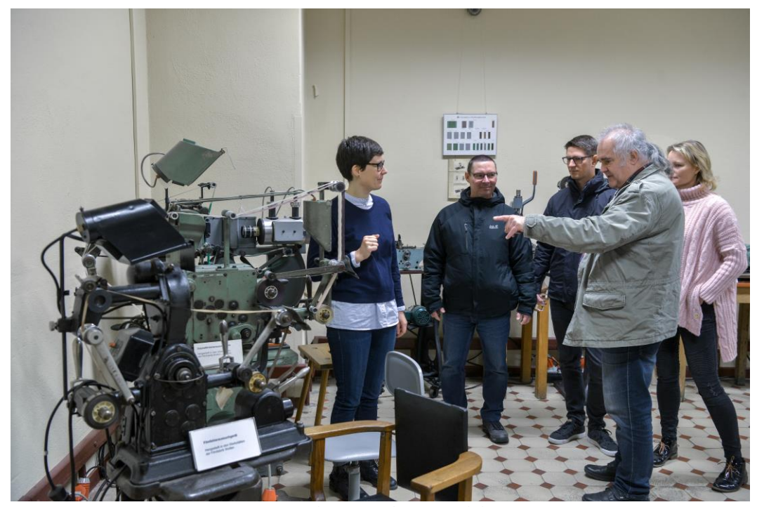
Fig. 19: Exchange in the IFM exhibition

In addition, developing more collaborative work with collections would underline yet further the role of the publicly funded museum's staff as custodians, and not as owners, of collections that are there to serve the common good. Thus, interaction with collections, objects and artefacts can provoke not only an interest in, but also a deep sense of a common and shared responsibility towards cultural heritage. This can also be applied to private collections, since cultural heritage is a collective issue.