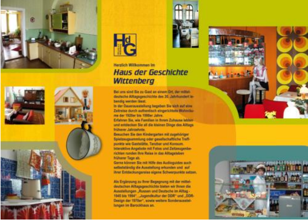
Figure 7: HdG, Flyer<sup>49</sup>