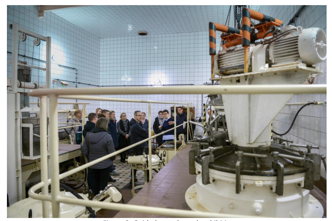
Figure 2: Guided tour through exhibition

At the "Daring Participation!" workshop, Holz described the faithfully recreation of the working environment, "it has no plaques or information boards, but is set up to feel as if the staff are just out of the room taking a break. There are film cameras displayed for a sense of nostalgia, an archive of plans and the newspapers all promote socialism and its success".