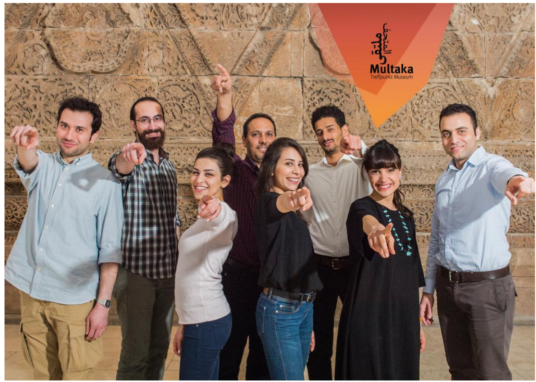
Figure 11: Multaka guides, ISL-SMB-PK

TAMAM is mainly addressed to representatives of mosque communities, Islamic associations and youth organisations in Germany, especially in Berlin (in total until now 14 corporations have committed). Originally, the TAMAM team planned to collaborate with imams. However, since the cultural education and youth work are mainly carried out by volunteers (ca. 18-25 years old), the group of participants consists of other communities' members. Indirect beneficiaries and target groups are young Muslim people (ca. 16-24 years old) living in Germany as part of third and fourth generations and who have not previously been, or are otherwise rarely, involved in museums' educational programmes.<sup>71</sup>