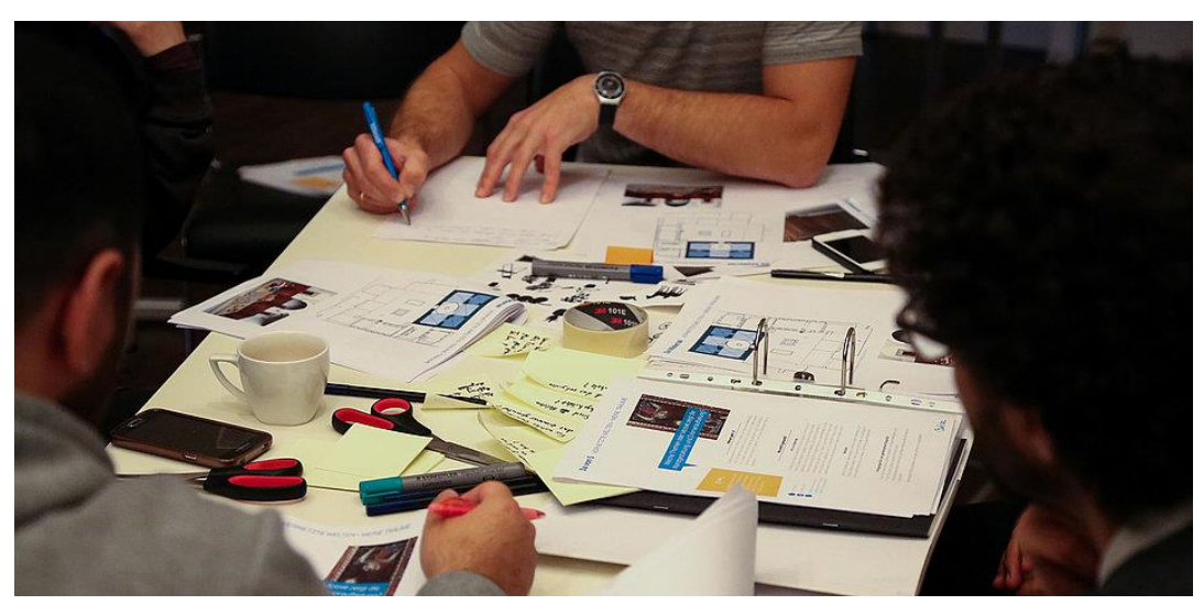
Figure 12: TAMAM workshop

Within the framework of TAMAM, specific educational lesson units and learning materials, as well as the analogue and digital presentation of the project, were jointly discussed and developed with representatives of mosque communities in order to support their ongoing cultural and youth work (Fig. 12). These were collaboratively implemented in workshops that covered the entire production process (in terms of both content and concept). The project started with a needs assessment to identify the requirements of each community and to learn about the specific structures and framework conditions of their work. In this way, the current needs of the specific situations of Muslim communities in Germany could be carefully considered. Objects from the museum's collections were jointly chosen to be used as starting points to address issues such as connecting and connected worlds, religious diversity, and shared heritages and equality. Representatives were then entrusted with tasks, in accordance with the needs of the participants and of the project, and also with the abilities of the participants. Structurally, the project was open to further involvement of participants and the budgeting allowed for an extension of the project team. Thus, some of the people involved could be incorporated as project staff.