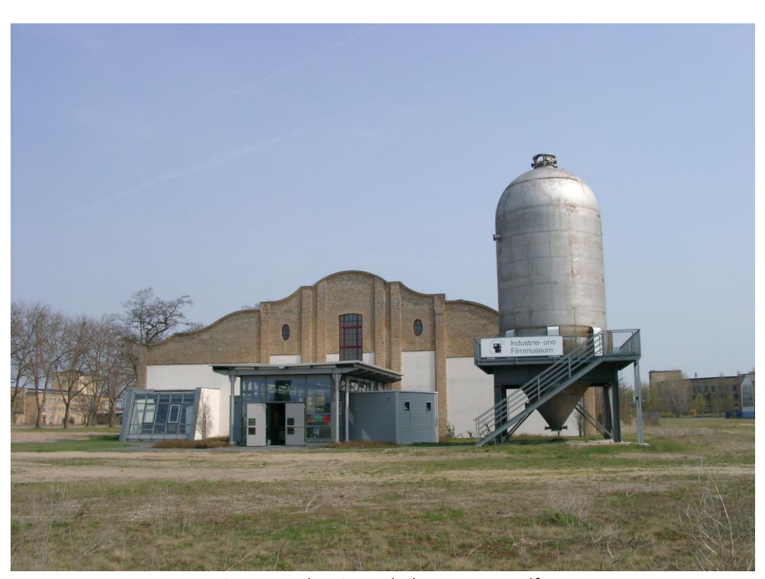
Figure 1: Industrie- und Filmmuseum Wolfen

The Industrie- und Filmmuseum Wolfen<sup>33</sup> (Fig. 1) organises the "Bilderschau" (Picture Show), where former employees of former film factory Wolfen (ORWO) are invited to participate in the content exploration of the photographic collection, whose stock comes from the archives of the former factory.