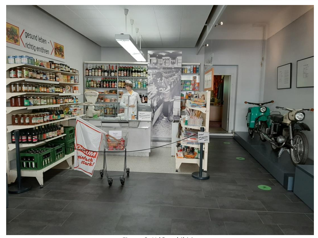
Figure 8: HdG, exhibition © Christel Panzig, photo: Christel Panzig

The BFD and the Volunteering programme are addressed to all people interested. The persons involved in the HdG are from very diverse backgrounds and age groups. One observation is that these volunteers are often in upheaval, and somewhat difficult life situations.<sup>53</sup> Additionally, although this type of engagement is voluntary and the majority of people are involved at their own initiative, there are cases where persons are encouraged by the employment office to undertake voluntary service at the HdG.