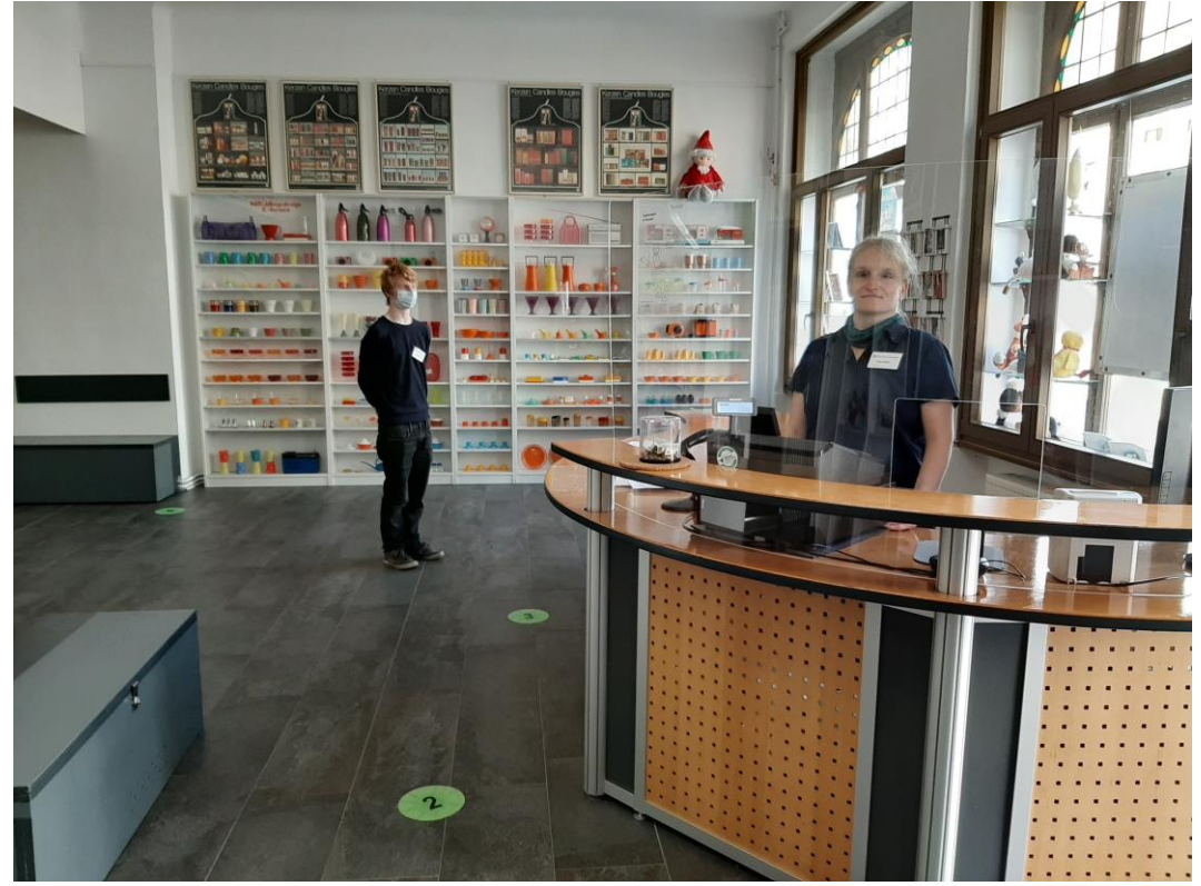
Figure 9: Volunteers at the HdG

Due to the different organisational affiliations, the two programmes of engagement are funded by different budgets. The Federal Voluntary Service provides "pocket money" of a maximum of 402€ plus costs for accommodation and food. In contrast, the volunteers receive remuneration of 100€. <sup>56</sup>