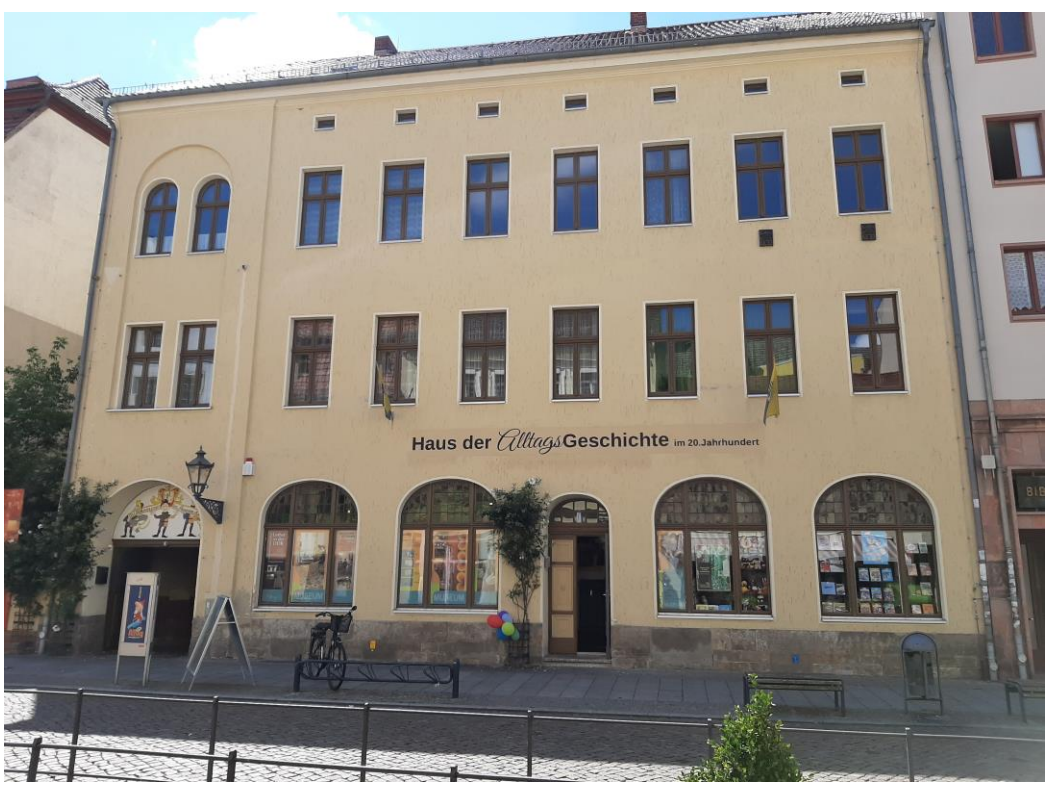
Figure 6: Haus der Geschichte, Wittenberg

In the Haus der Geschichte<sup>45</sup> (Fig. 6), citizens can engage in the framework of the Bundesfreiwilligendienst, (Federal Voluntary Service, BFD) and Ehrenamt (Volunteering), working in various areas of the institution. Its work is also strongly connected with research projects on the history of Wittenberg in the 20<sup>th</sup> century, especially through its strand of interviewing citizens as eyewitnesses.<sup>46</sup> Another very important and interesting feature in the context of civic involvement and engagement is that the museum was founded by a civic association and is also still run "voluntarily" on the basis of personal commitment.