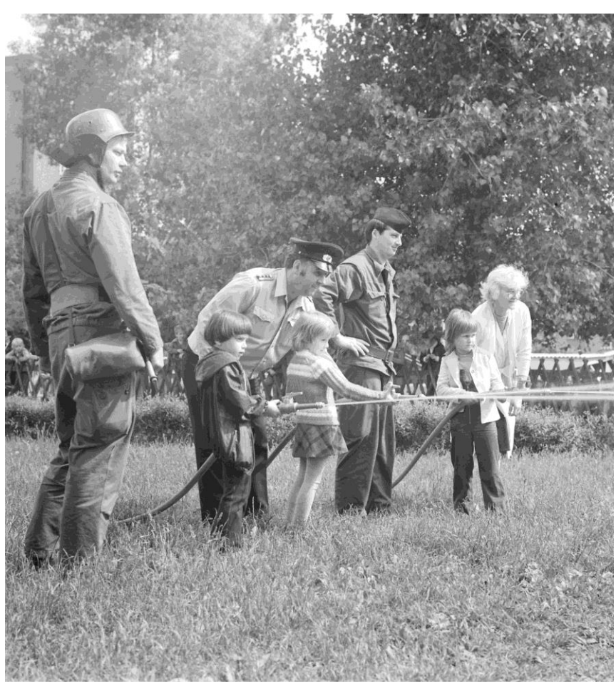
Figure 5: Social sphere of ORWO

Since their commitment is very free, focused on their meeting and exchange following foremost their own wishes and needs, there are no discernible problems for this party involved.